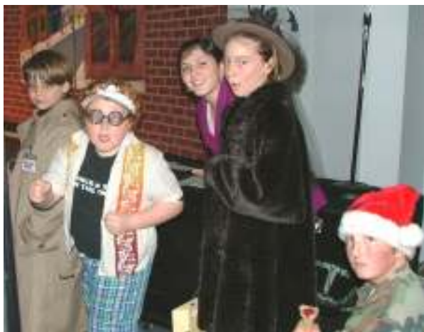
Above: Drama students get into character backstage before the Christmas play